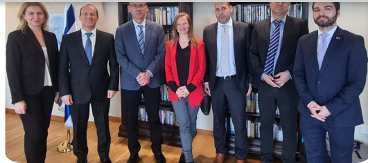
Breakfast meeting hosted by the Ambassador of Israel to Romania