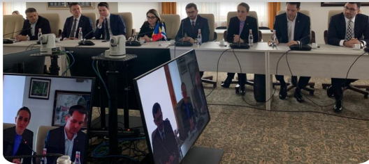
Meeting with Members of the Chamber of Deputies of the Romanian Parliament