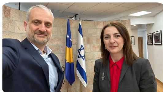
ELNET-Israel CEO meets with the Chargé d'Affaires of Kosovo to Israel

1st Romania-Israel Strategic Dialogue: This month ELNET hosted the first ever Romania-Israel Strategic Dialogue. The Dialogue focused on the shared strategic challenges for Israel, Romania and Europe at large and future opportunities for cooperation. The panels included critical and timely conversation about Israeli and Romanian strategic environments, the war in Ukraine, the Black Sea, energy and food security, and the involvement of superpowers.