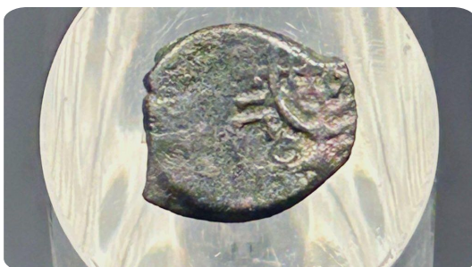
Inauguration ceremony for the re-opening of the Davidson Center