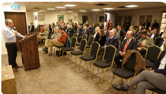
ELNET hosts exclusive private event for European Diplomats and Policymakers