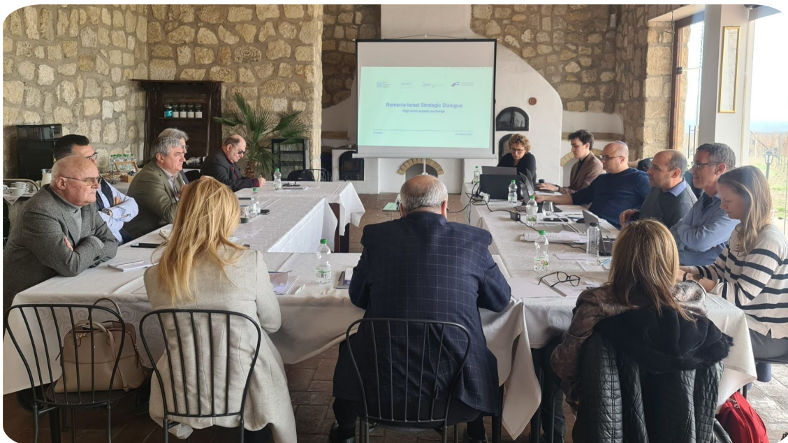
ELNET holds the first ever Romania-Israel Strategic Dialogue