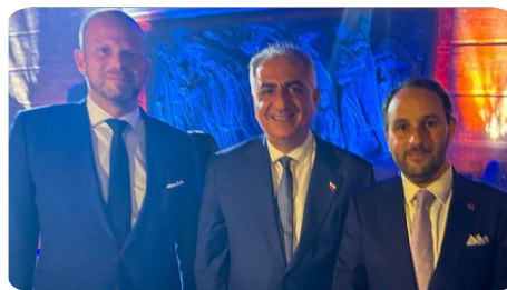
At Yad Vashem ceremony, delegates together with Reza Pahlavi, Crown Prince of Iran