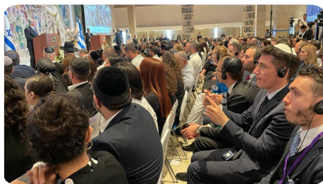
Delegates attend the Yom HaShoah Ceremony at the Knesset