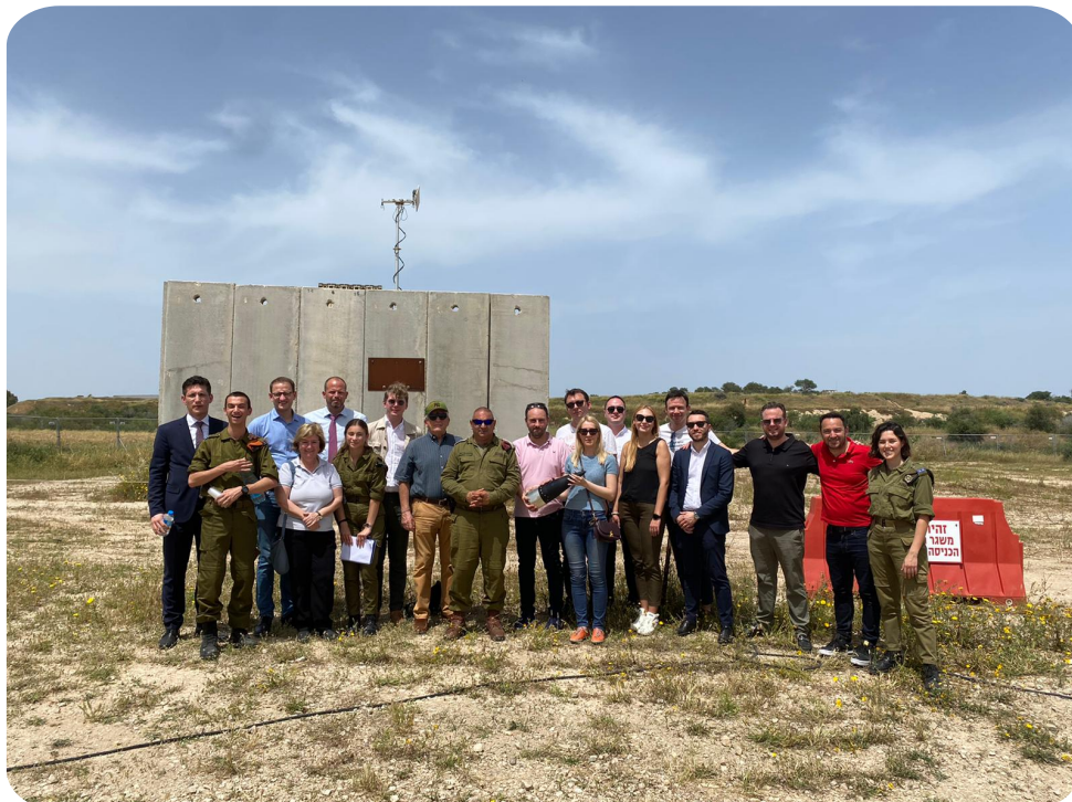
Young European Leaders Delegation at entrance of a Hamas terror tunnel