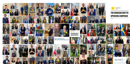
Warsaw Ghetto Uprising 80th Anniversary Daffodil Campaign led by ELNET