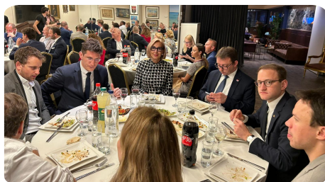
European Ambassadors attend dinner event with young political leaders