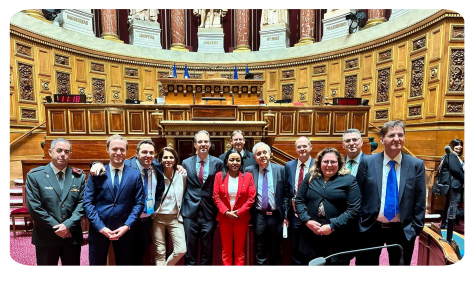
Members of Knesset meet with Members of the French Senate during the EIPC