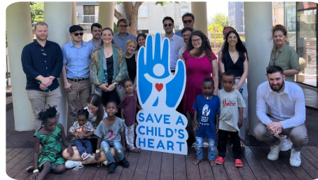
Labour Parliamentary Advisors Delegation visits Save a Child's Heart