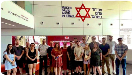
Labour Parliamentary Advisors Delegation visits underground blood bank