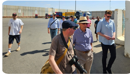
UK journalists Delegation visit the Kerem Shalom border crossing with Gaza