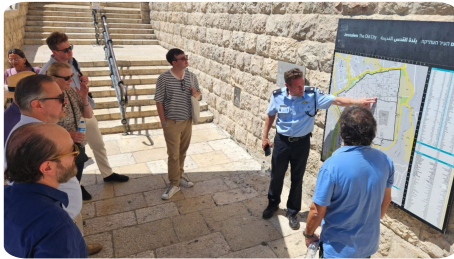
UK journalists are briefed by Israel Police on counterterrorism at Mabat 2000