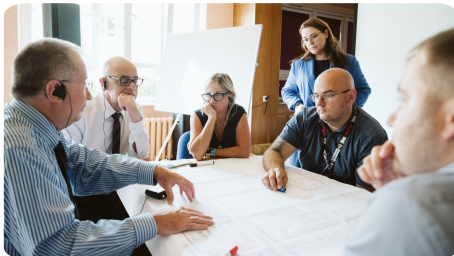
ELNET-CEE organizes crisis management training course in Poland