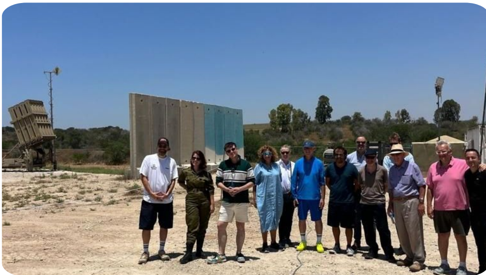
UK Journalists Delegation visits an Iron Dome aerial defense battery