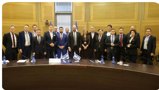
Pan-European Solidarity Mission meet with Knesset Speaker Amir Ohana