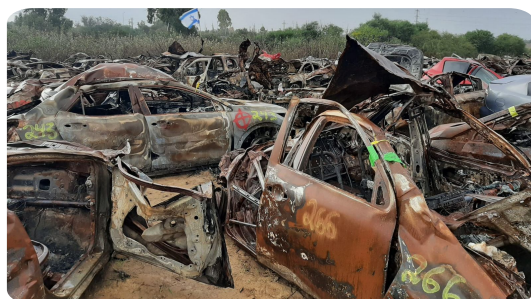
Pan-European delegation sees incinerated cars from the Nova music festival