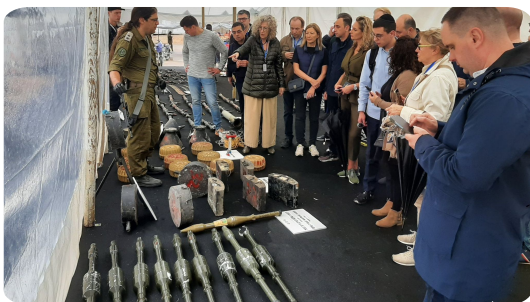
European MPs observe weapons and ammunition seized from Hamas