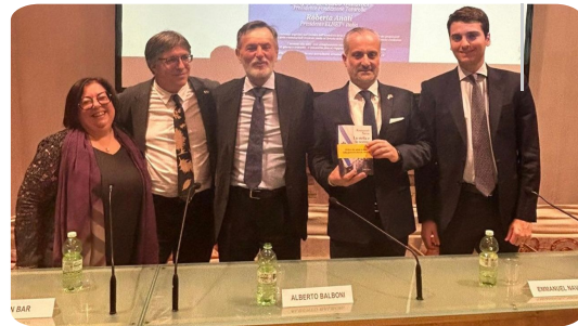
ELNET-Israel CEO and ELNET-Italy CEO at launching of New ELNET office