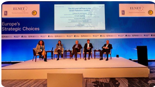
Panel hosted by ELNET at the Chatham House Conference in Berlin