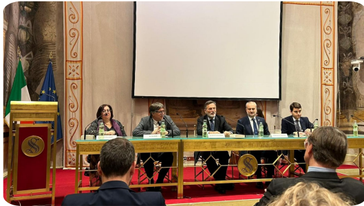
Inauguration event at the Italian Senate for the official launching of ELNET-Italy