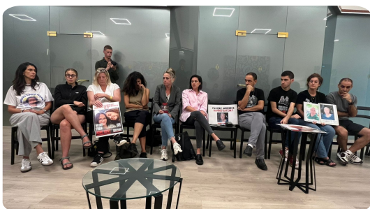
Families of hostages meet with European MPs to share their stories