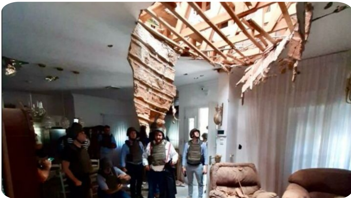
Participants on ELNET Solidarity Mission at Sderot house directly hit by Hamas rocket