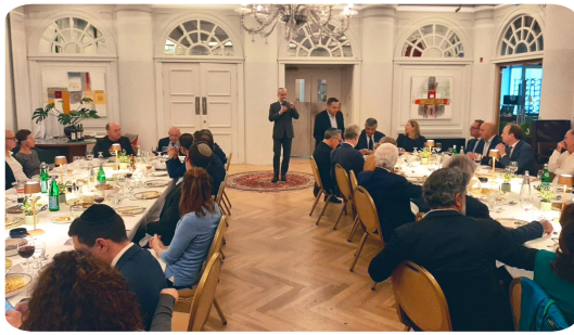
ELNET-Israel CEO addresses European parliamentarians and diplomats