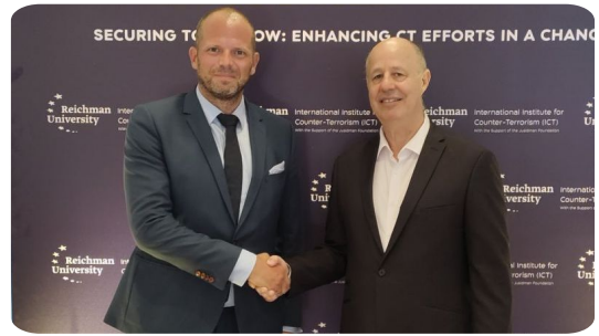
ELNET arranges meeting for Belgian MP Theo Francken and Israel's NSA Tzahi Hanegbi