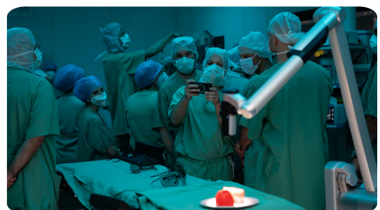
The Israeli GINSUM delegates tour Germany's Smart Hospital