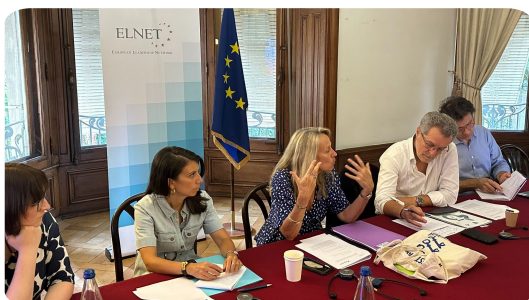
ELNET hosts the latest round of the Strasbourg Forum