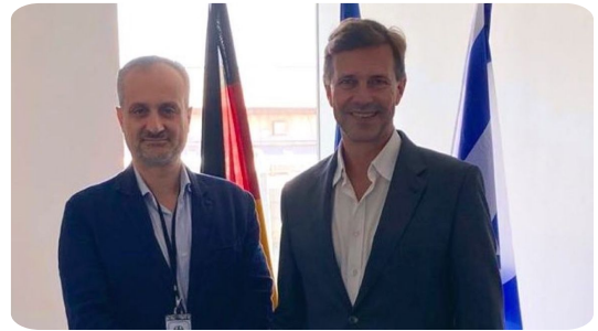
ELNET-Israel CEO meets with German Ambassador to Israel Steffen Seibert