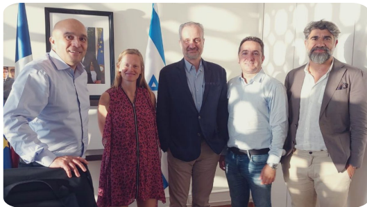
ELNET-Israel meets with new French Ambassador to Israel Frederic Journeaux