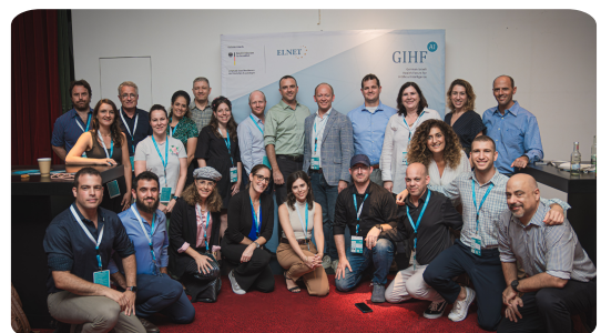
ELNET's GINSUM program brings biggest delegation of Israelis to Germany