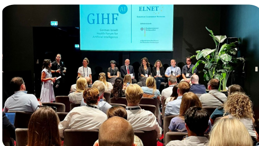
ELNET's innovation program GIHF-AI hosts its second annual conference in Germany