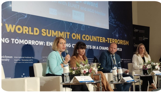
Panel discussion co-hosted by ELNET and NGO Monitor at the ICT Summit