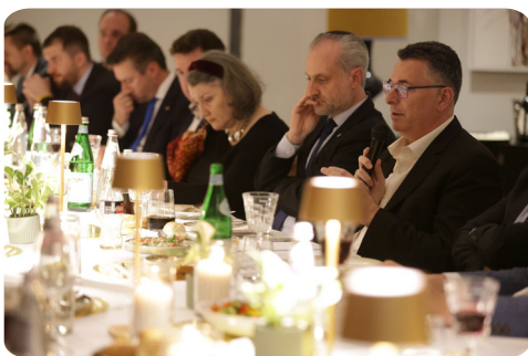
Dinner with Minister Gideon Saar