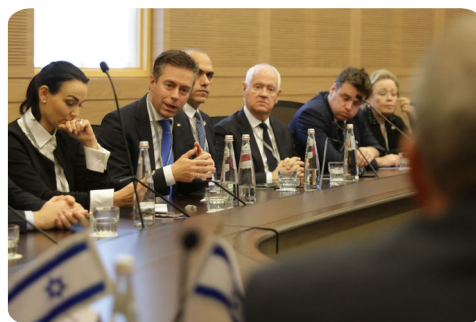
Meeting with Members of Knesset