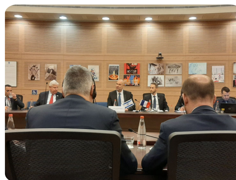
Meeting with Knesset Speaker MK Amir Ohana