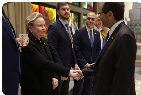
Meeting with President Isaac Herzog