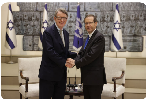
Meeting with President Isaac Herzog

The solidarity mission visited the ravaged communities and kibbutzim hit on October 7th, and the families of hostages. It met with President Isaac Herzog and with security cabinet member Gideon Sa'ar. Read More