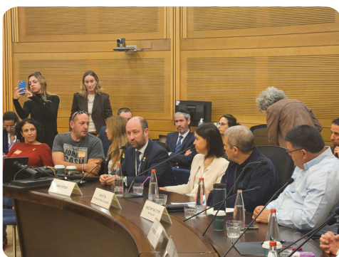
Senator Loïc Hervé speaks before the Knesset's Commission for the Liberation of the Hostages

Addressing the Knesset's Commission for the Liberation of the Hostages, Senator Hervé said that France does and will continue to do its utmost for the unconditional release of all hostages. The delegation also met with France's ambassador to Israel Frédéric Journès, with Knesset Speaker Amir Ohana, with Minister Gideon Sa'ar, and with senior members of Israel's Ministry of Foreign Affairs.